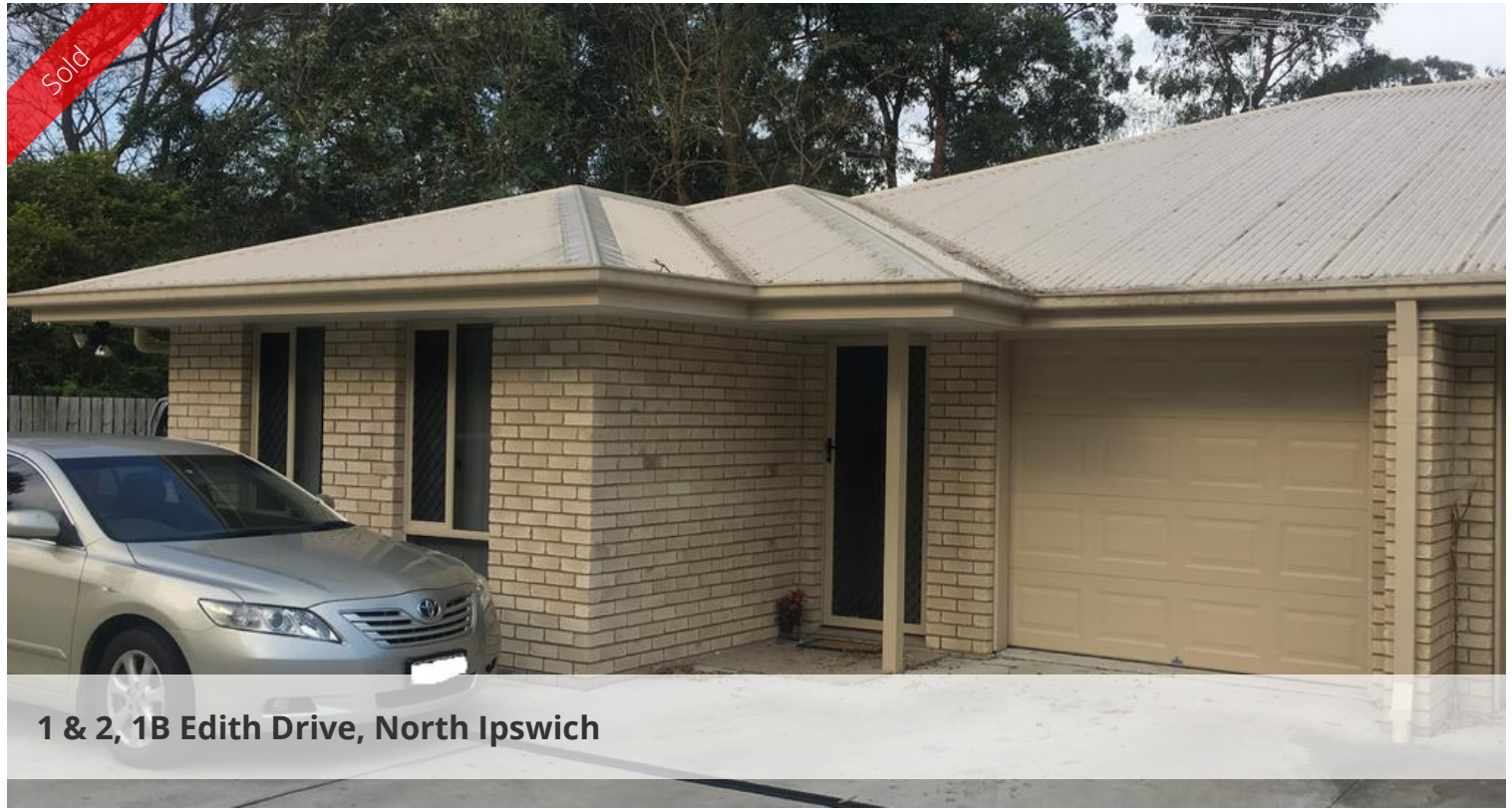
1 & 2, 1B Edith Drive, North Ipswich