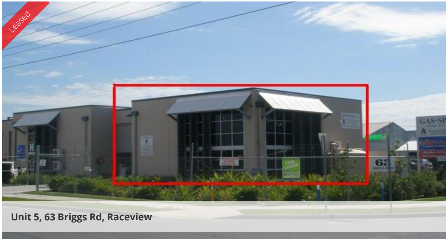
Unit 5, 63 Briggs Rd, Raceview