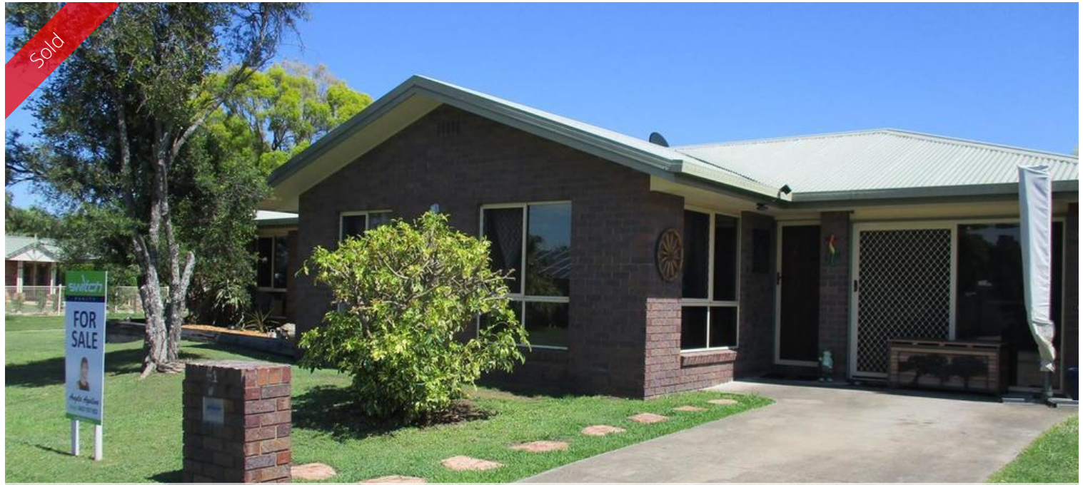
41 Bernadette Cres, Rosewood