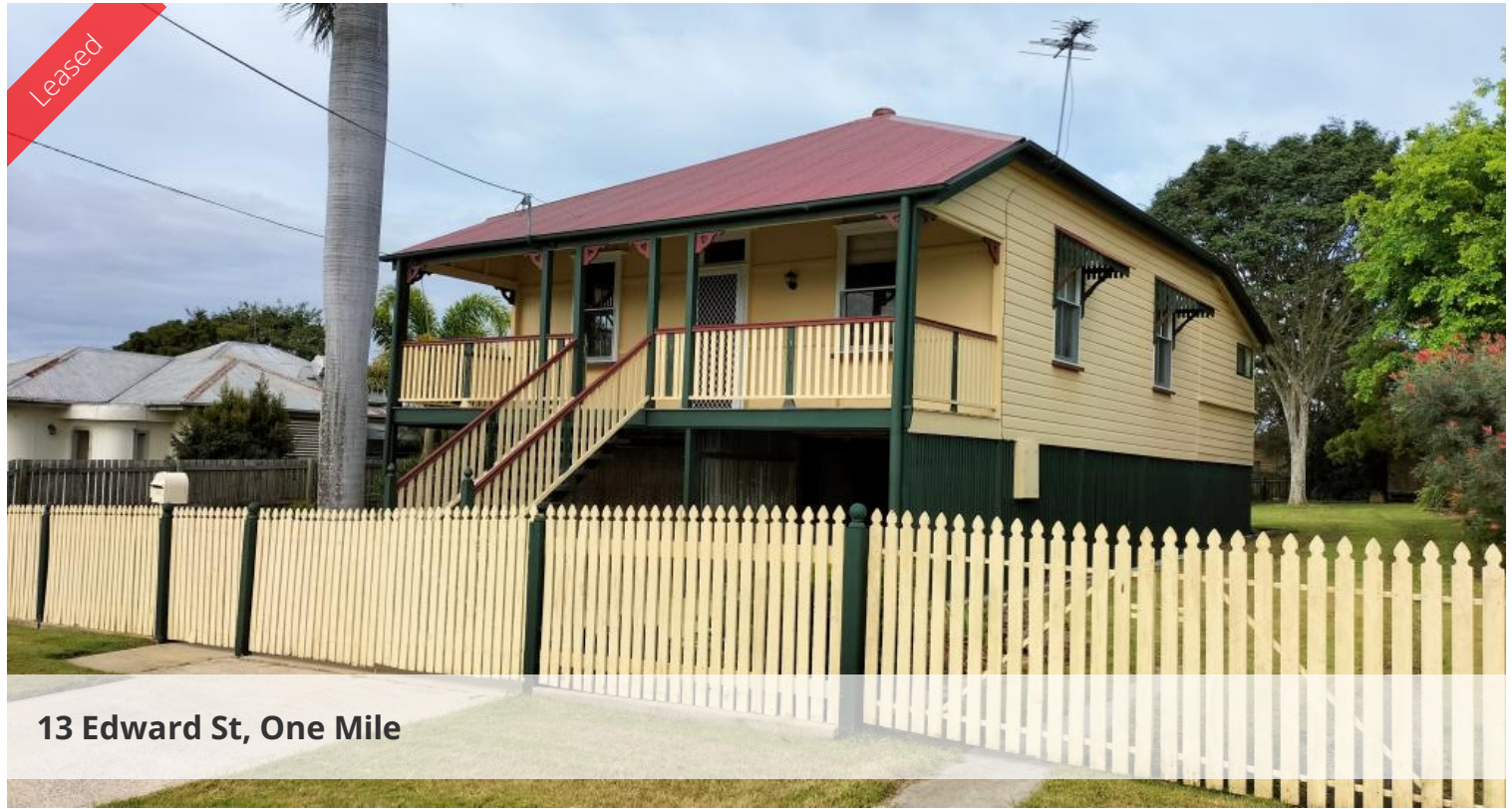
13 Edward St, One Mile