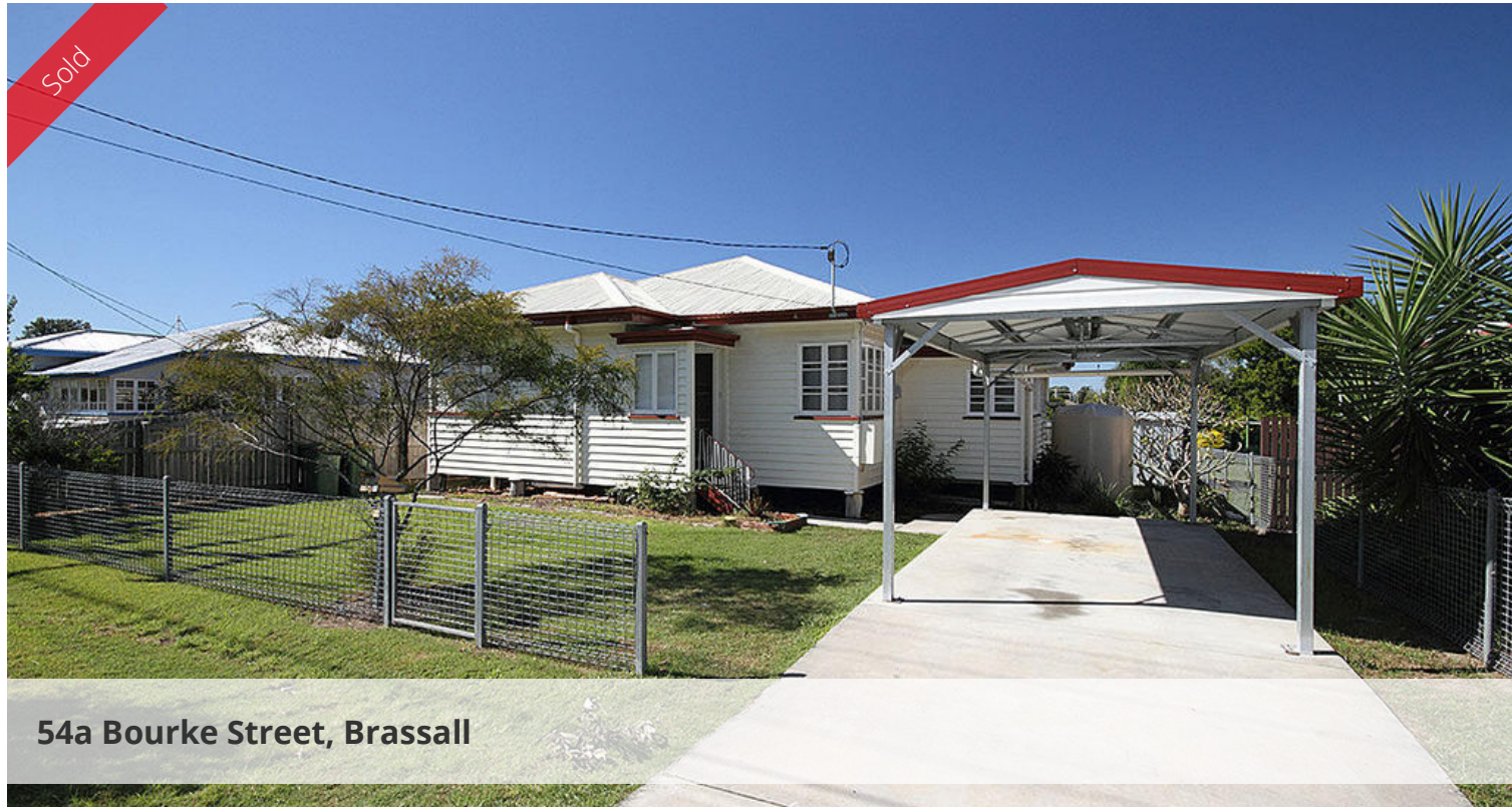
54a Bourke Street, Brassall