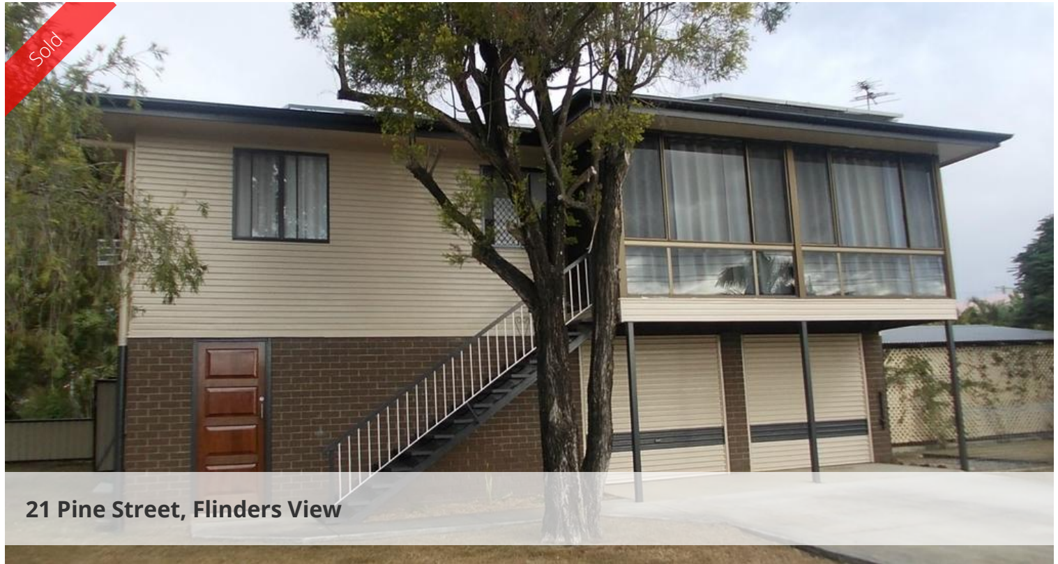
21 Pine Street, Flinders View