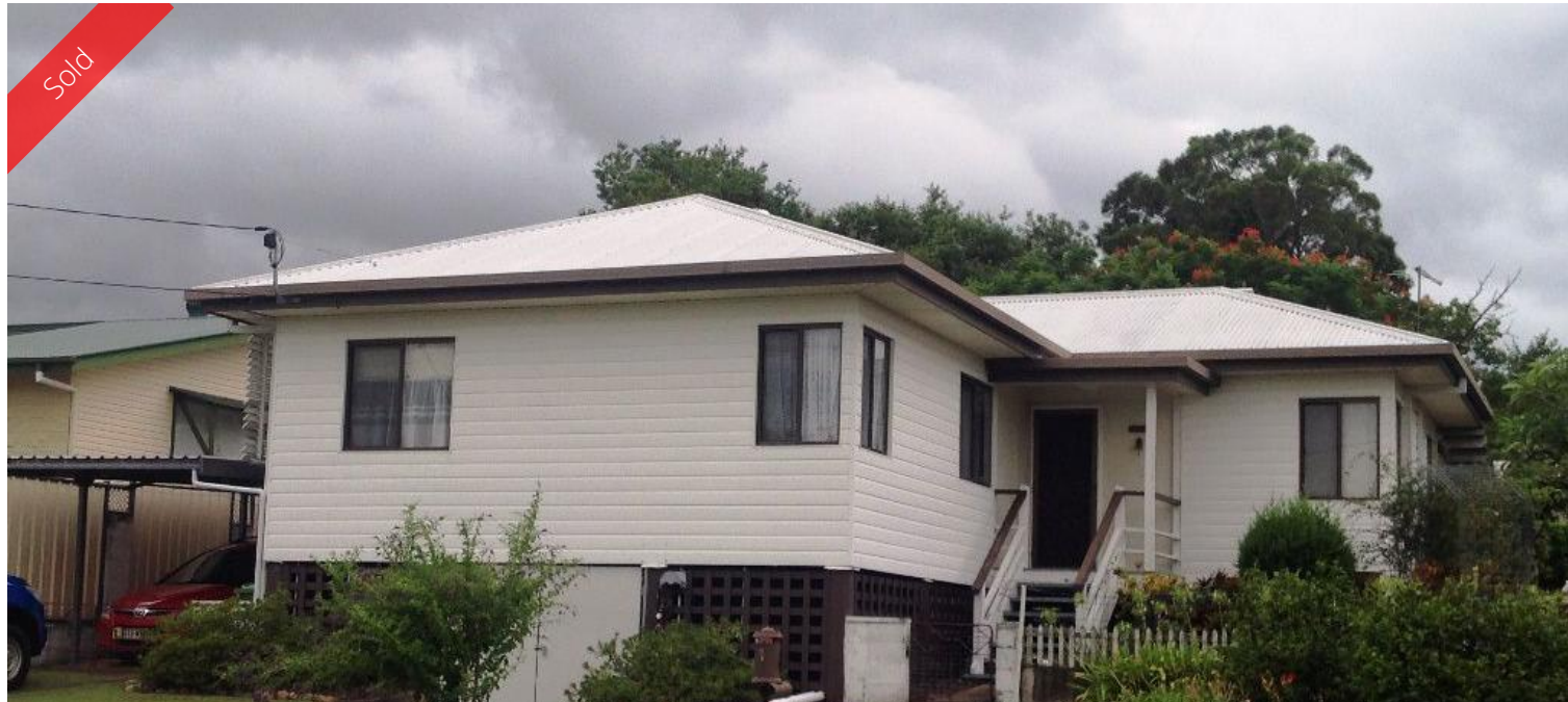
1 Chilcot Street, Silkstone