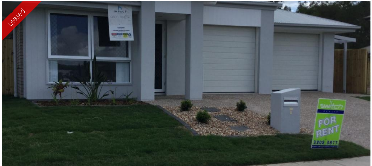
House 1, 42 Waterfern Way, Ripley