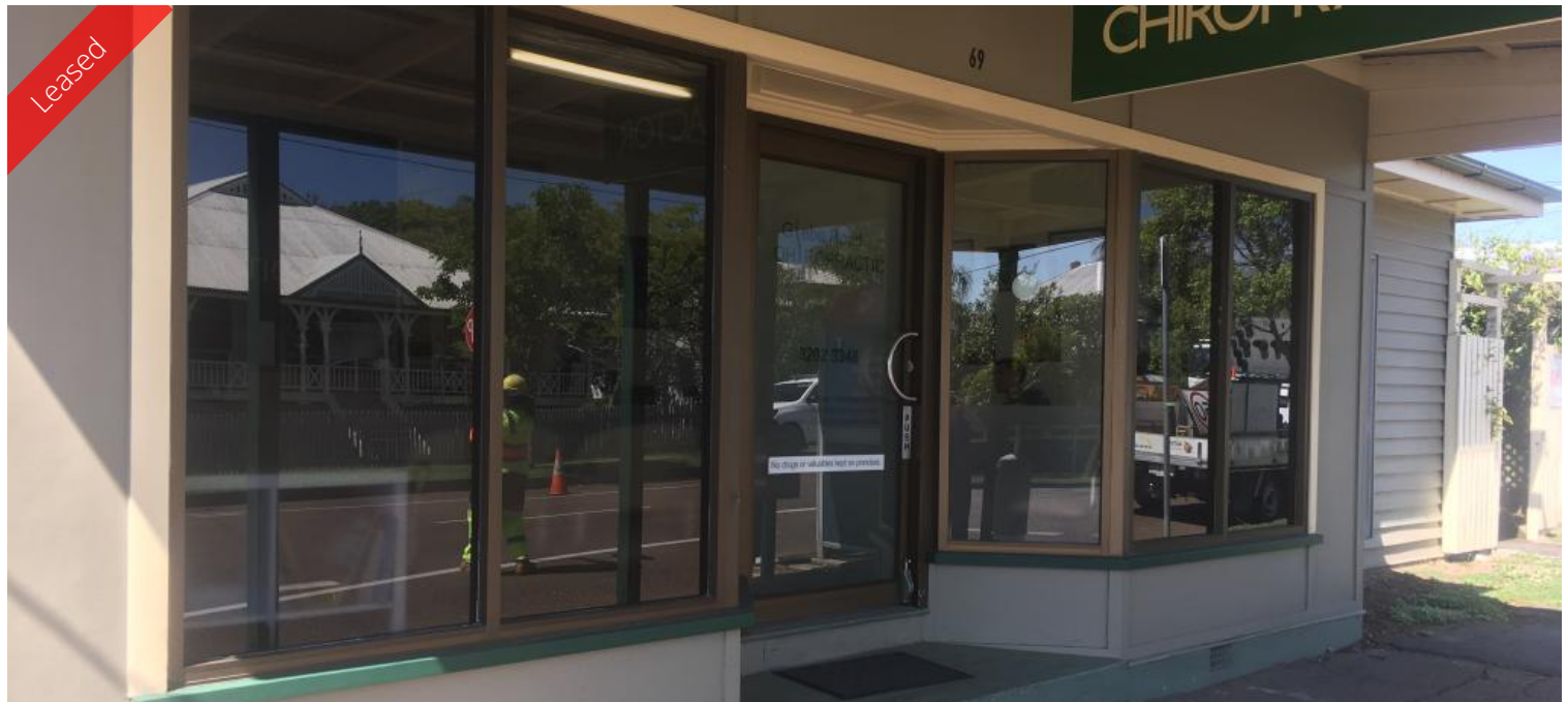
Shop 1, 69 Glebe Rd, Silkstone