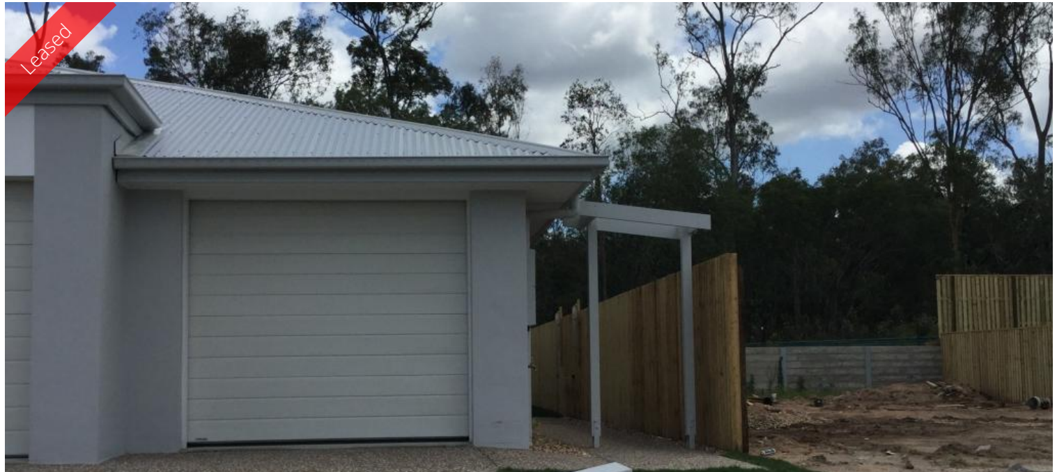
House 1, 42 Waterfern Way, Ripley