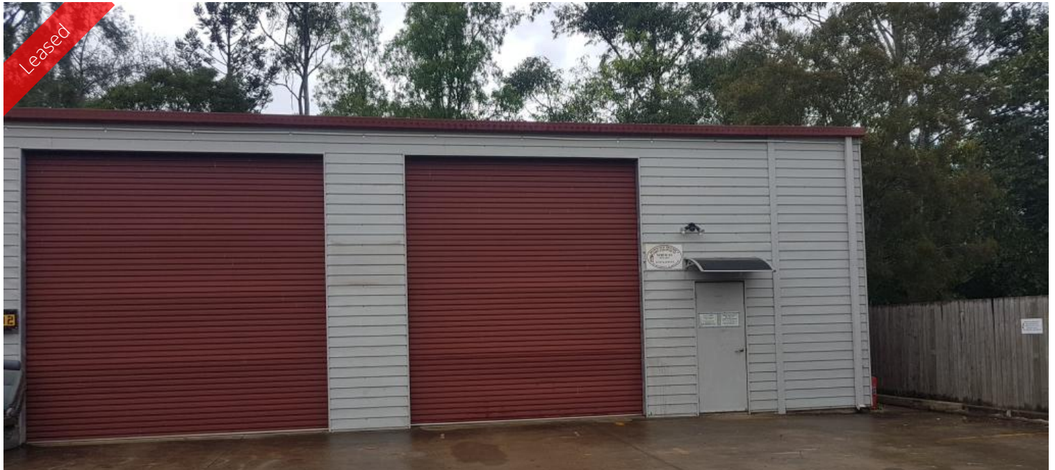
Unit 3, 106 Keogh St, West Ipswich