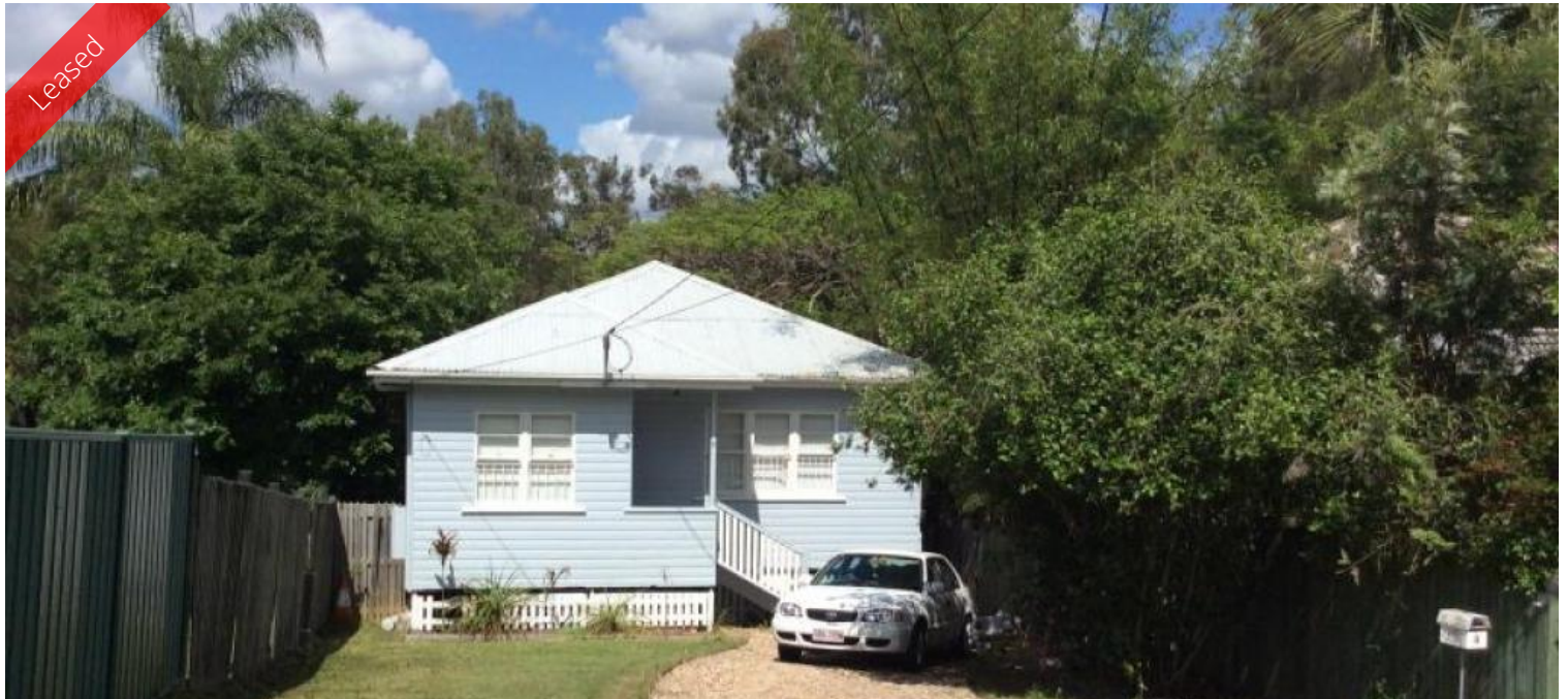
4 Scour Street, Tivoli