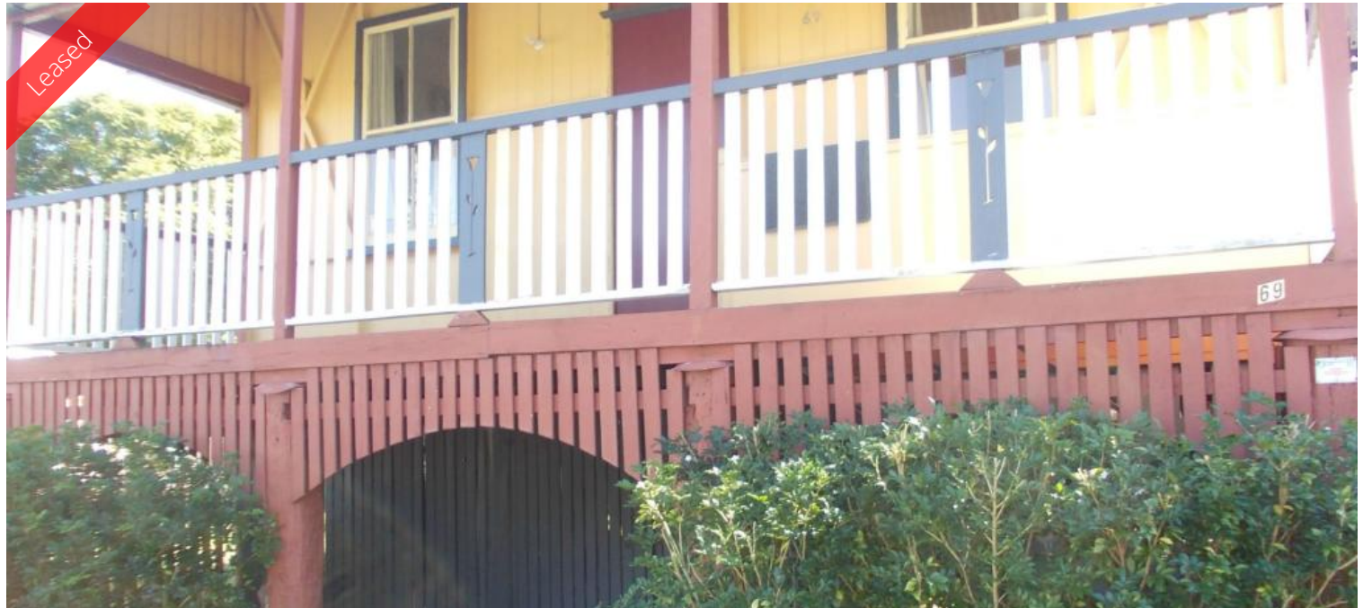
69 Darling Street, Ipswich