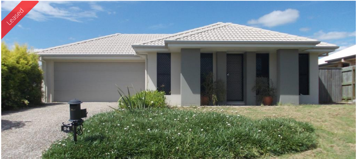
94 Jacaranda Drive, Yamanto