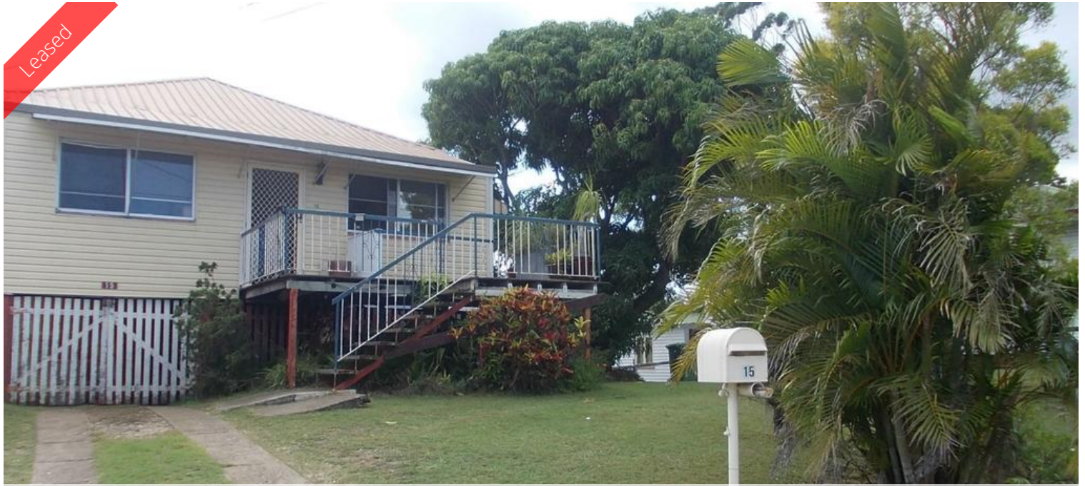
15 Law Street, Bundamba