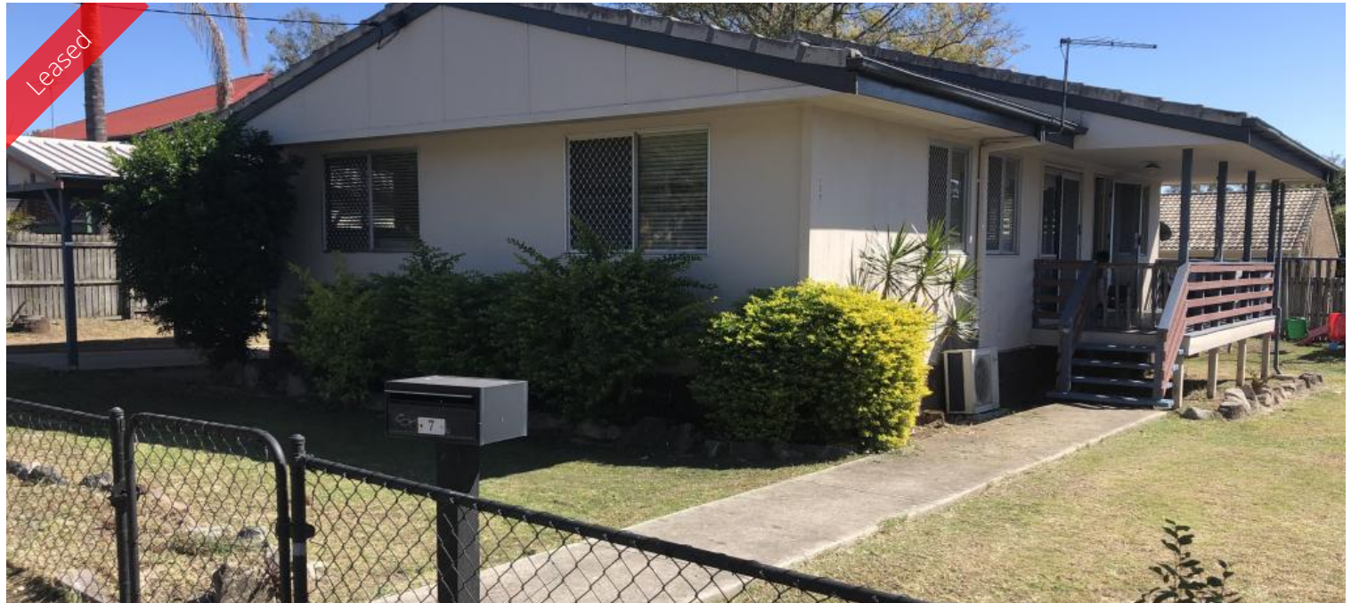
7 Alfred St, Riverview