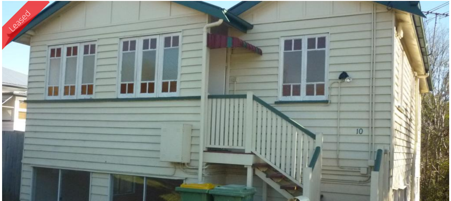
10 Gulland Street, North Ipswich