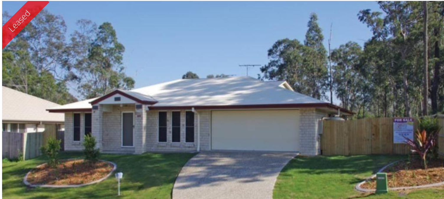
4 Stack St, Collingwood Park