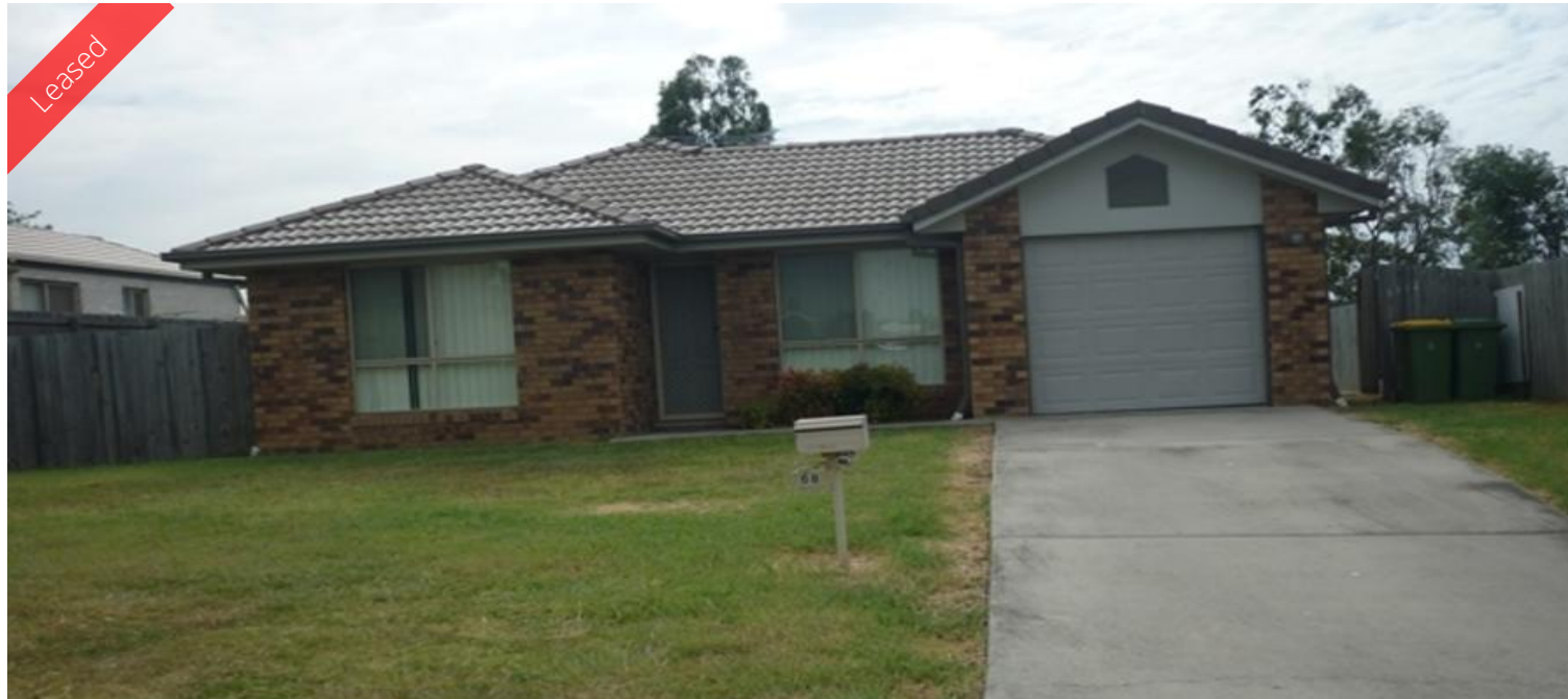
68 Anna Drive, Raceview