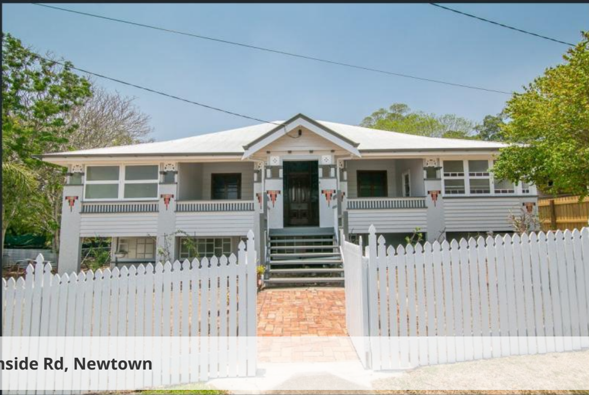
79 Chermside Rd, Newtown