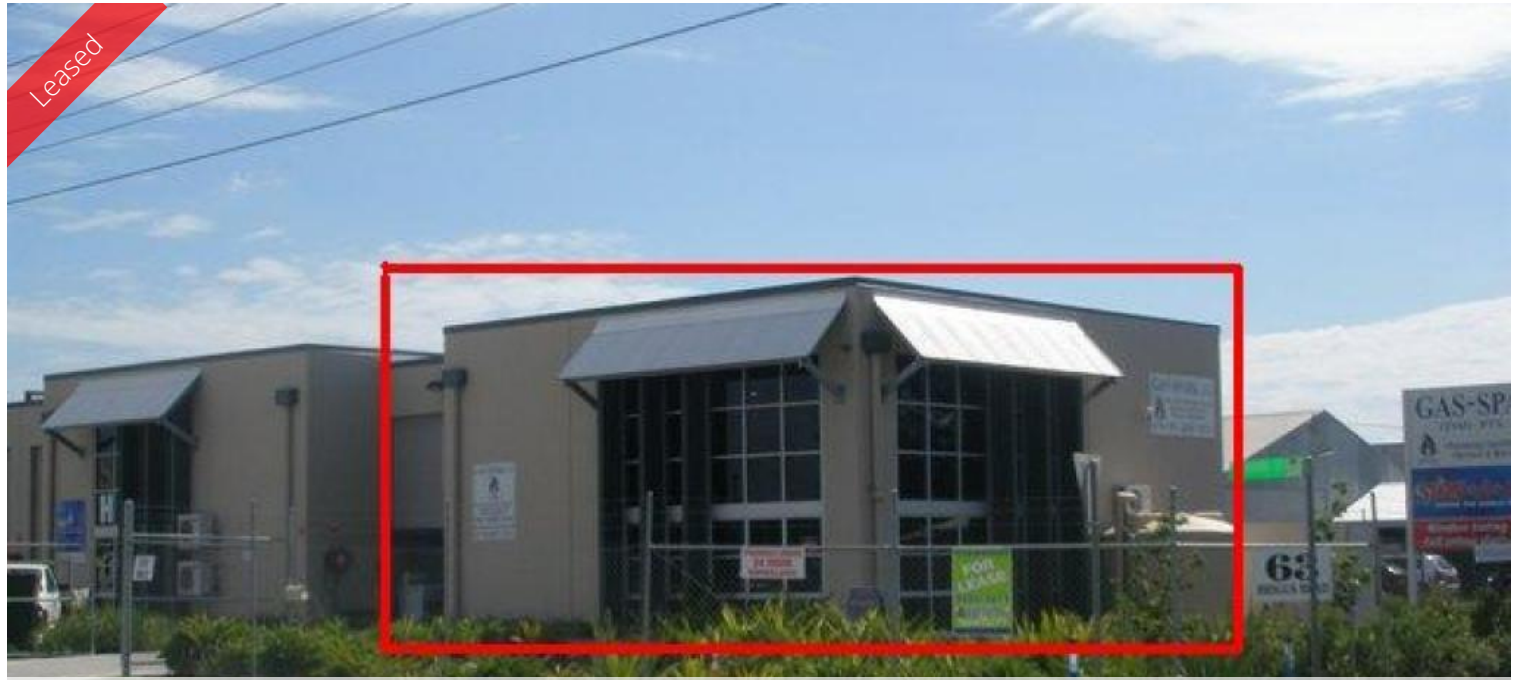
Unit 5, 63 Briggs Rd, Raceview