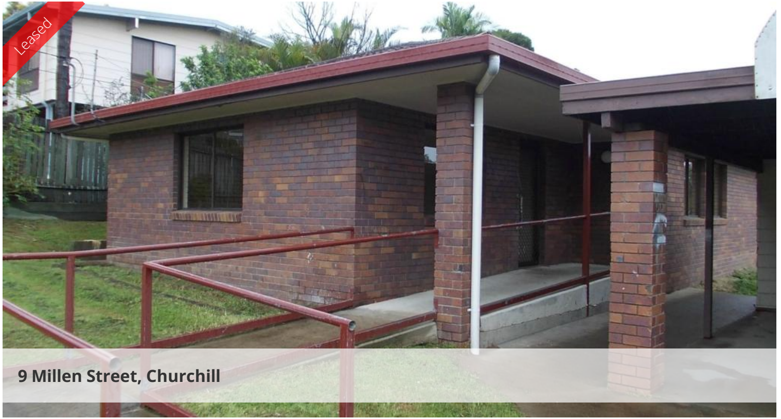
9 Millen Street, Churchill