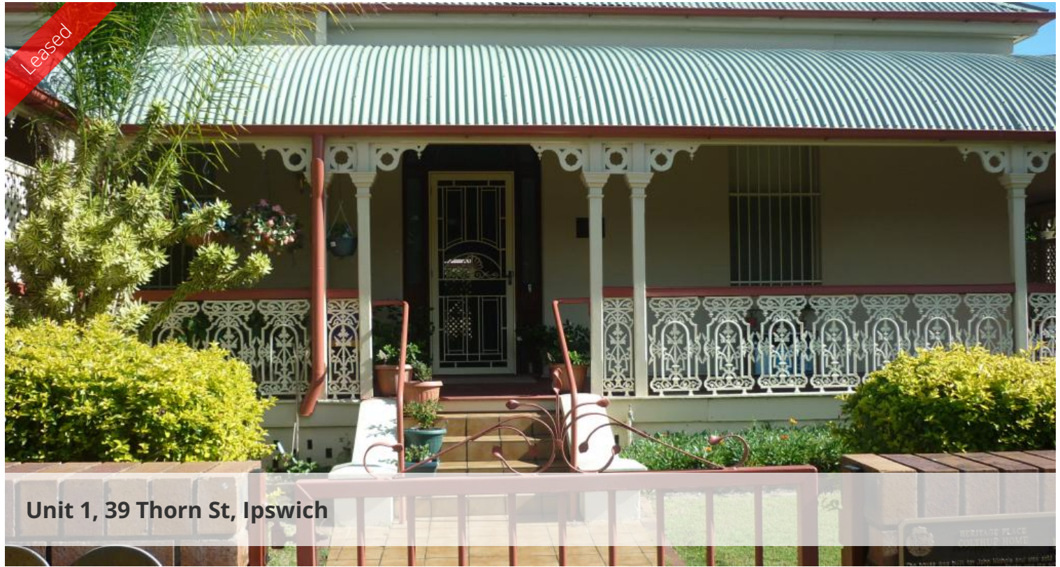
Unit 1, 39 Thorn St, Ipswich