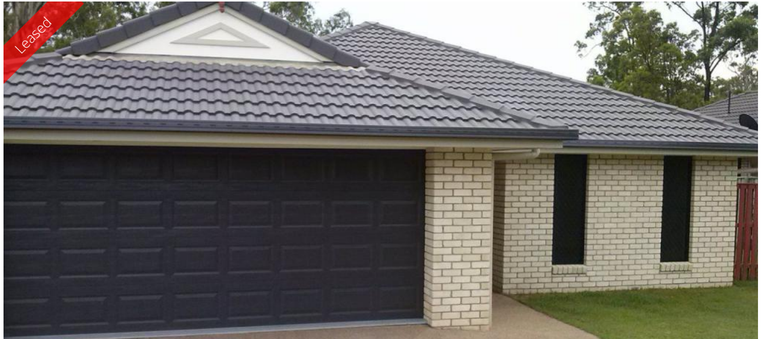
12 Brightwood Place, Fernvale