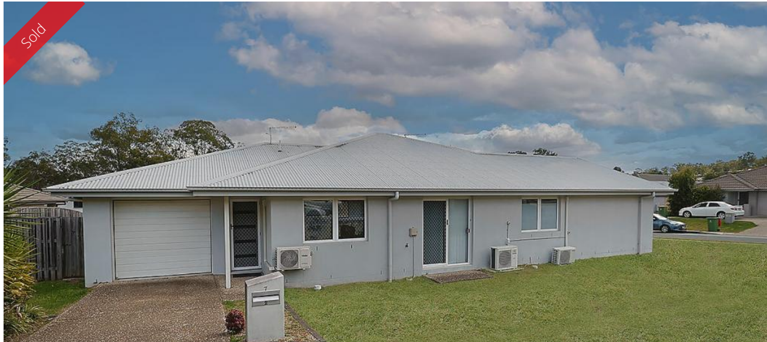
Unit 2, 7 Melville Dr, Brassall