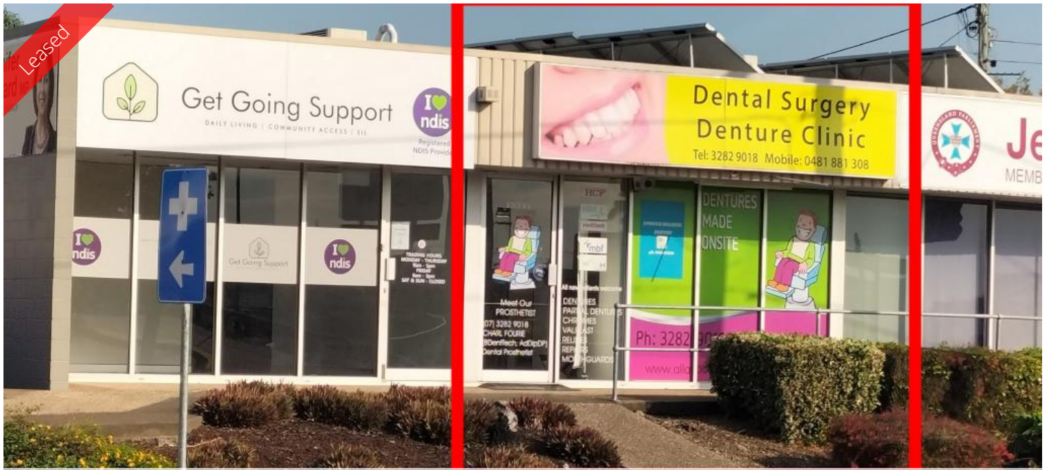
Unit 3, 125 Brisbane Road, Booval