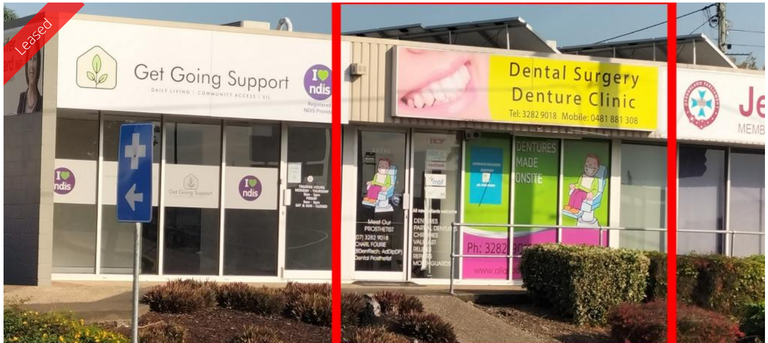
Unit 3, 125 Brisbane Road, Booval