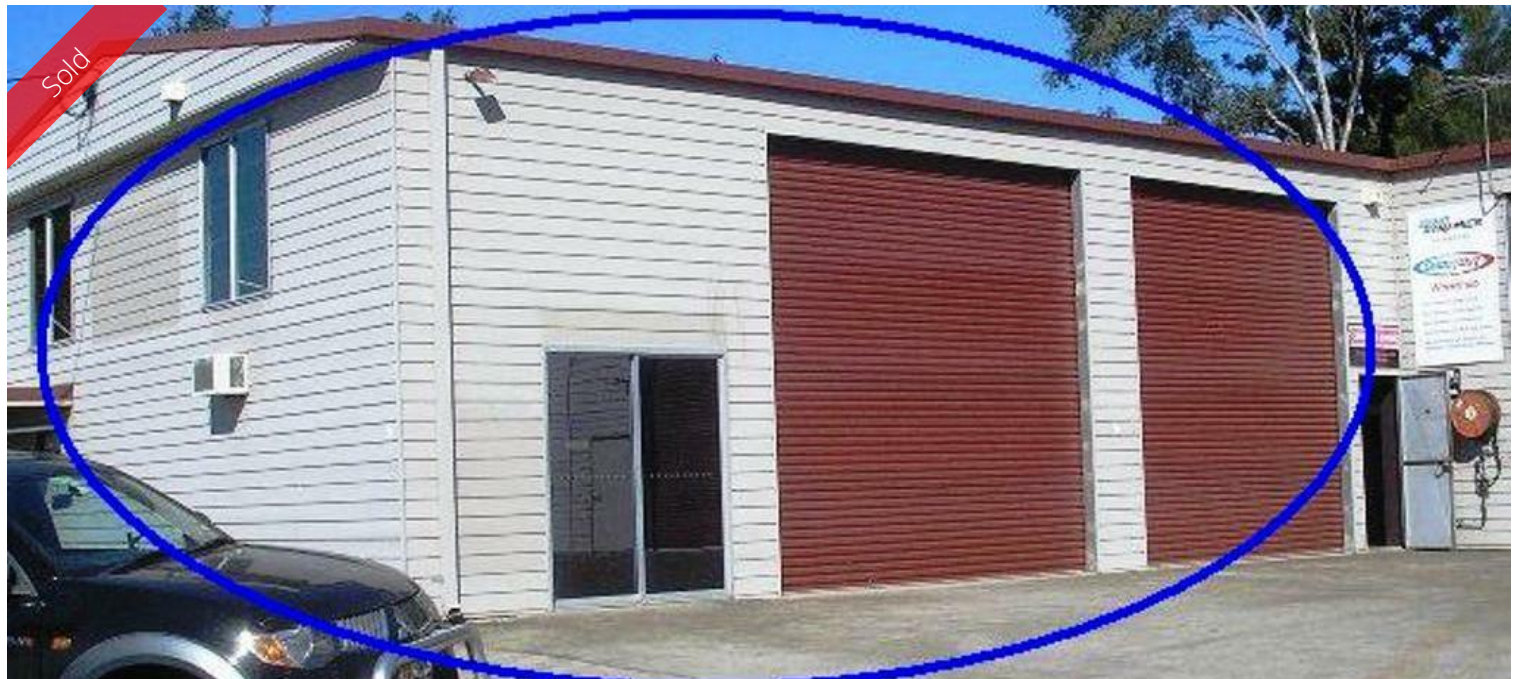
Unit 1, 106 Keogh St, West Ipswich