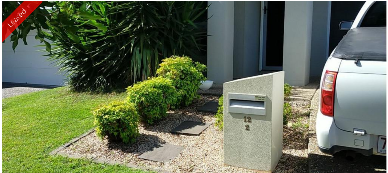
2, 12 Silky Oak Street, Ripley