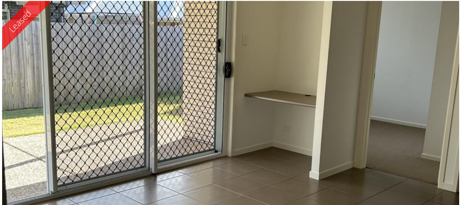
House 1, 12 Silky Oak St, Ripley