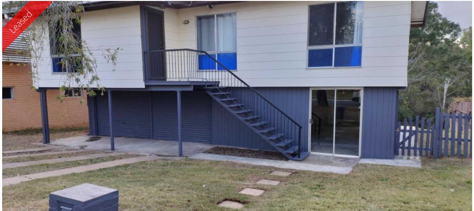
16 Bremer Pde, Basin Pocket