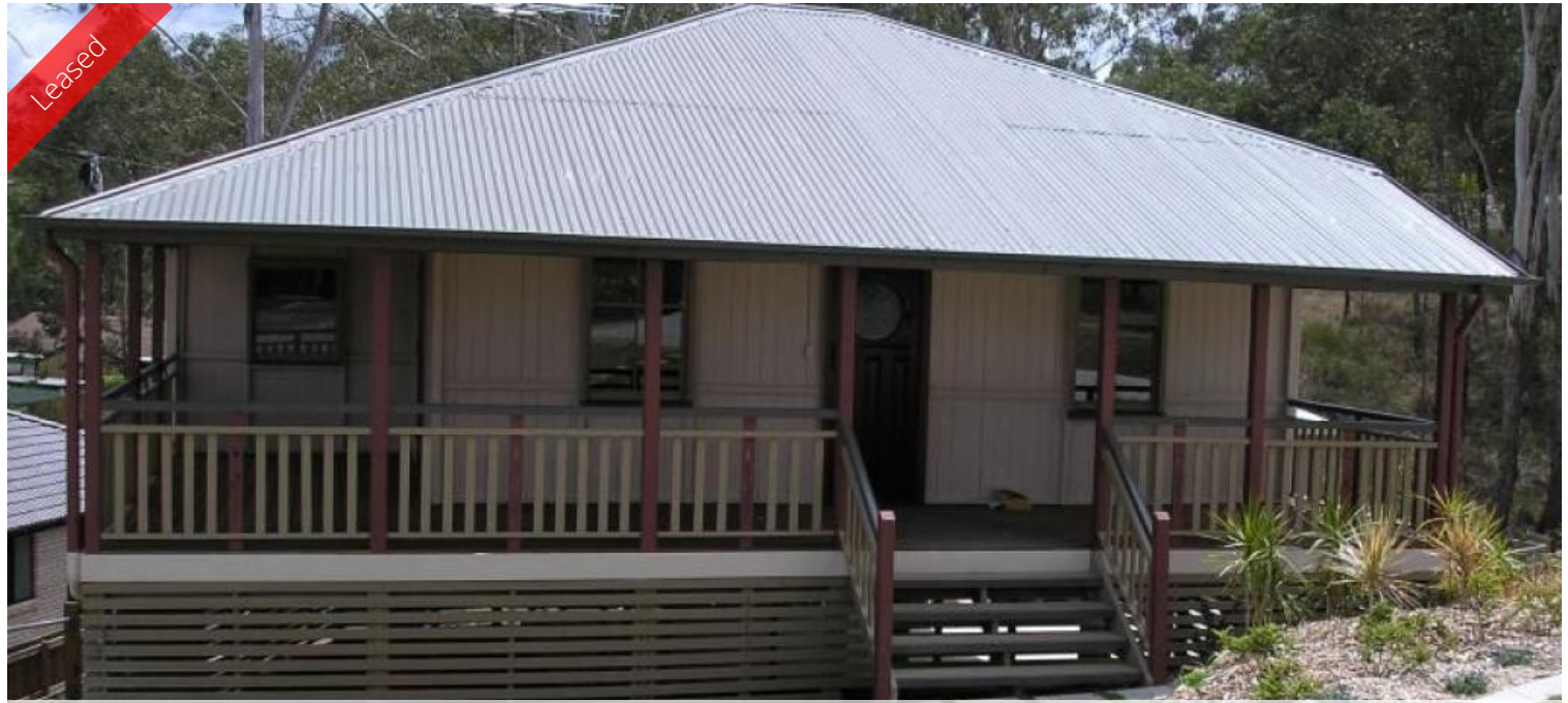
90a Braeside Road, Bundamba