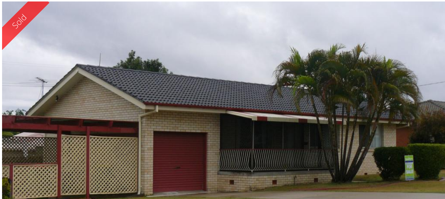
11 Trudy Street, Raceview