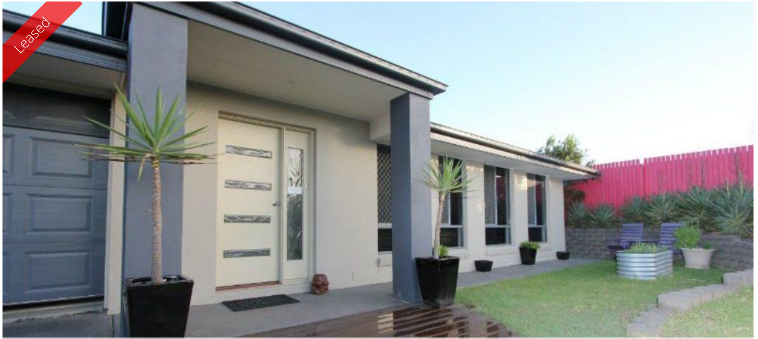
19 Sandhurst Place, Brassall