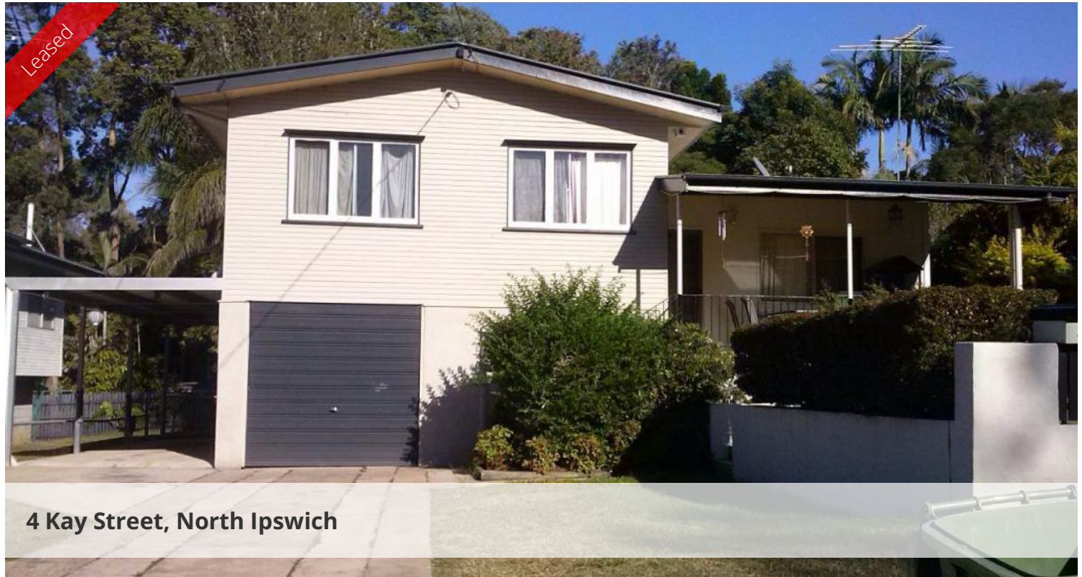
4 Kay Street, North Ipswich