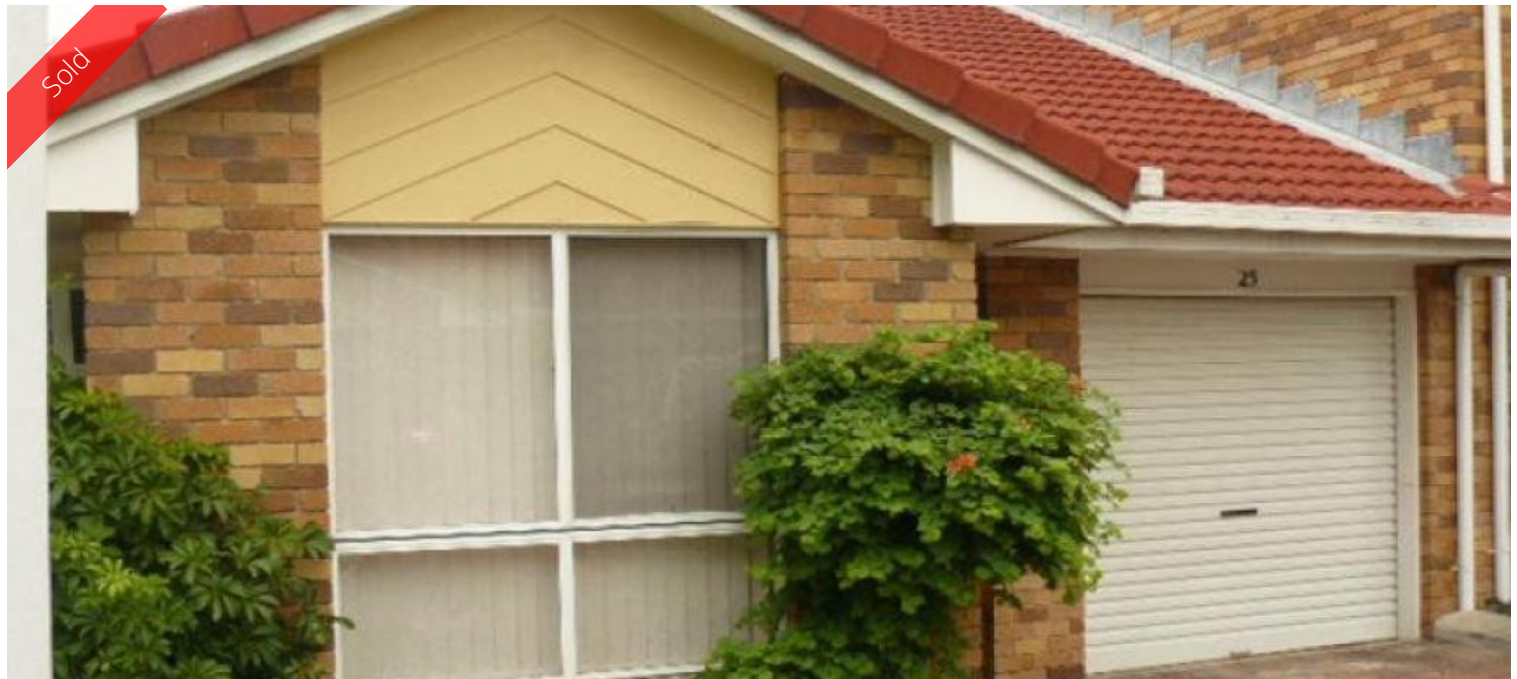
25, 11 Newtown Street, East Ipswich