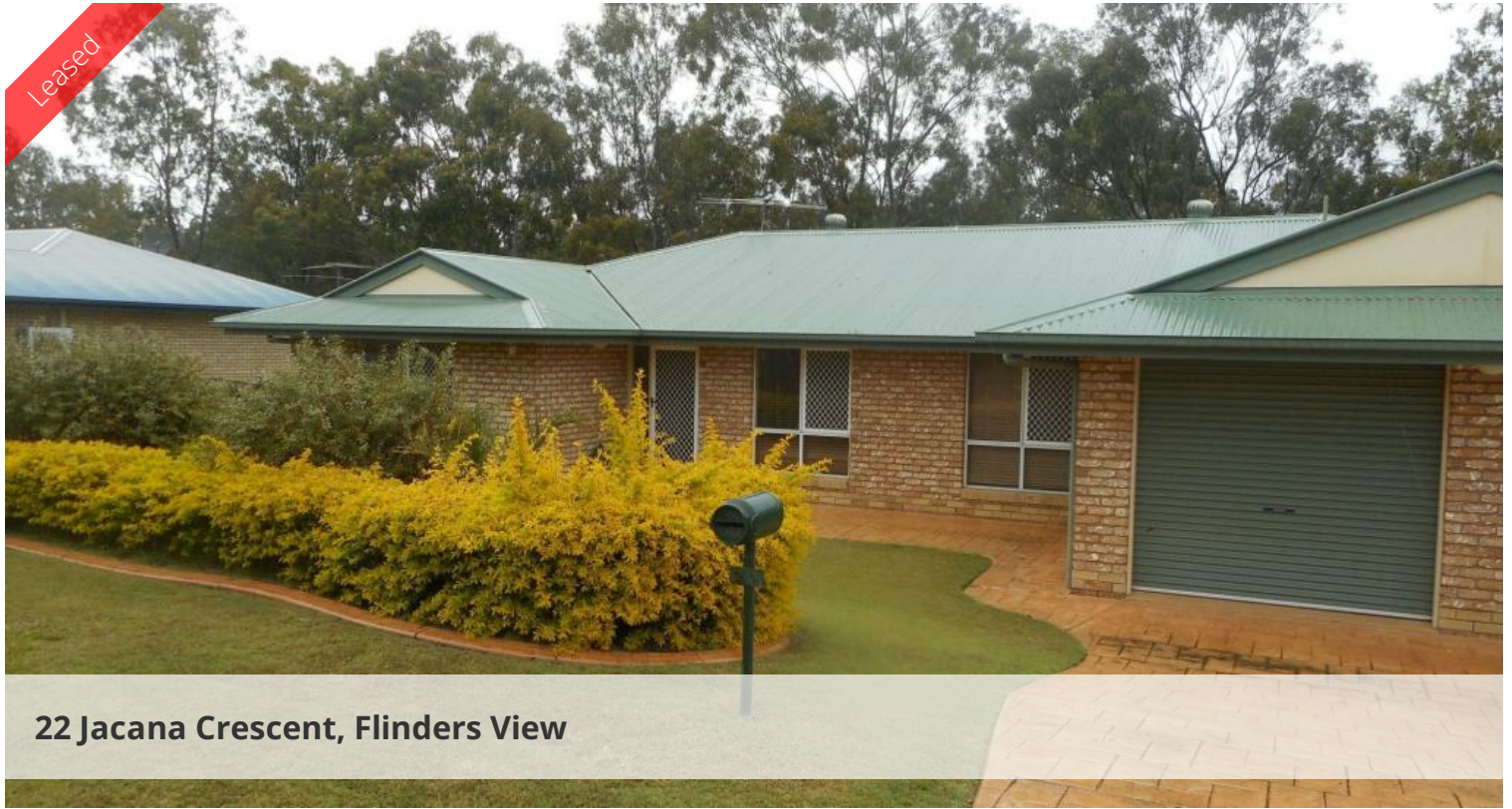
22 Jacana Crescent, Flinders View