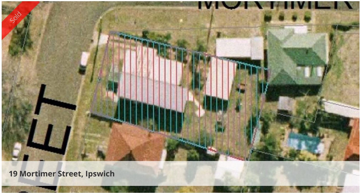
19 Mortimer Street, Ipswich